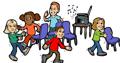
MUSICAL CHAIRS / STOELN DANS