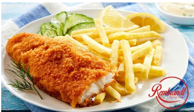
Crumbed Fish, chips and vegetables