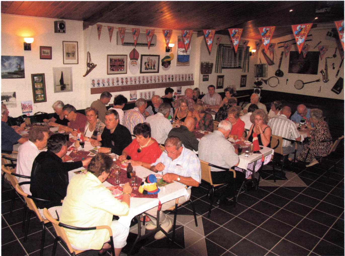
The 2006 Sinterklaas meeting organized in Café Oud Rijswijk