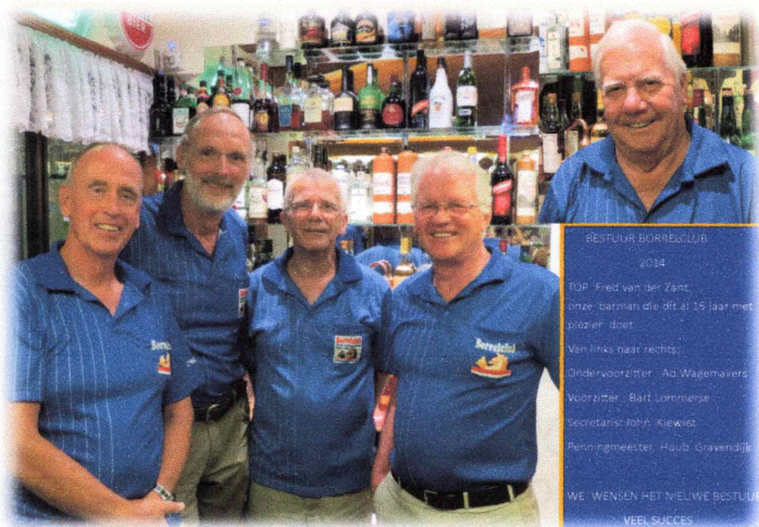
From L to R: