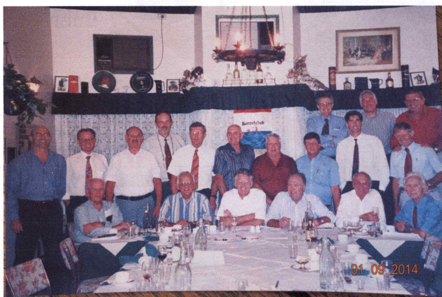
A group foto in the Cloak and Dagger restaurant in 2000.