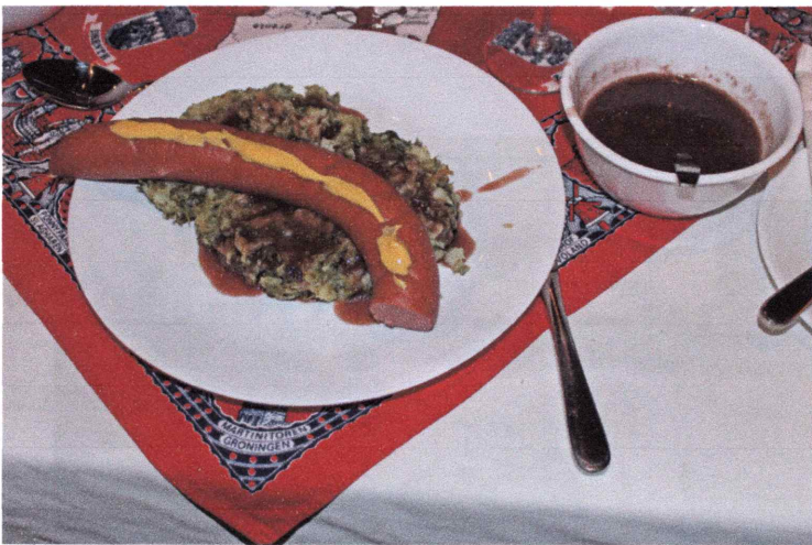
Oud Hollandse maaltijd: Boerenkool met worst.

However the fact that some of the members' partners serve the food creates a special atmosphere.