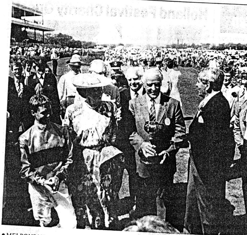
• MELBOURNE – Koningin Beatrix en Prins Claus bij de uitreiking van de Melbourne Cup.

DUTCH AUSTRALIAN WEEKLY, NOVEMBER 28, 1988