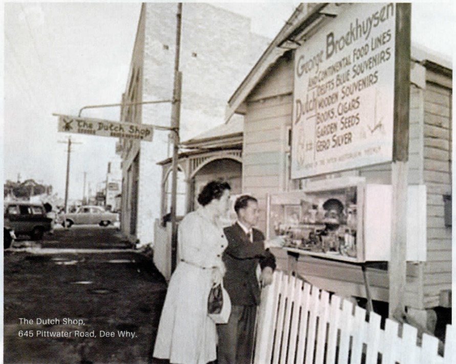
The Dutch Shop, 645 Pittwater Road, Dee Why.

more permanent accommodation, George switched from motorised delivery to a fixed shop. He converted the front room of his house, which was located on the western side of Pittwater Road, a little south of the Pacific Parade intersection.