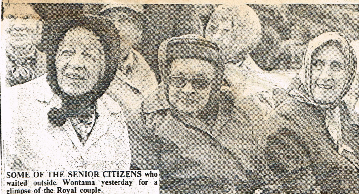
SOME OF THE SENIOR CITIZENS who waited outside Wontama yesterday for a glimpse of the Royal couple.