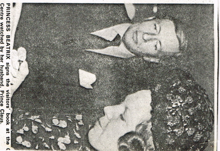
PRINCESS BEATRIX signs the visitors' book at the Centre watched by her husband, Prince Claus.