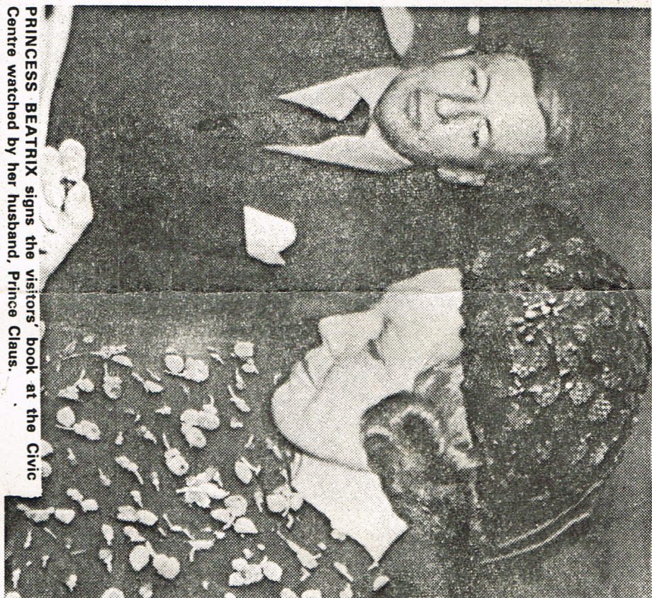
PRINCESS BEATRIX signs the visitors' book at the Civic Centre watched by her husband, Prince Claus.