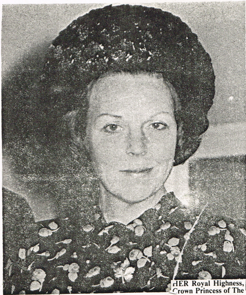
HER Royal Highness, Crown Princess of The Netherlands, on the dais at the Amoco Community Hall during the singing of the Dutch national anthem.