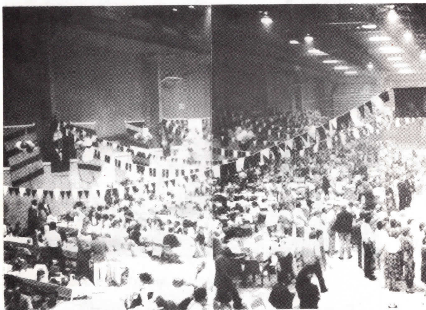
This was the crowd at our 2x11 Entertainment Centre in Liverp atmosphere was electrifying.