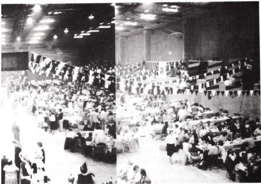
CELEBRATIONS in the E.G. Whitlam 1600 people all having fun. The