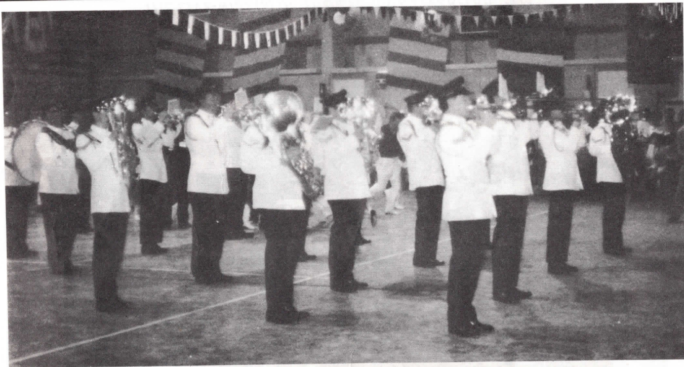
SERENADE TO THE JUBILEE BOYS IN LIVERPOOL 2x11