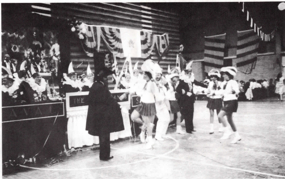
THE LIVE-WIRE(S) OF THE EVENING. LIVERPOOL 2x11